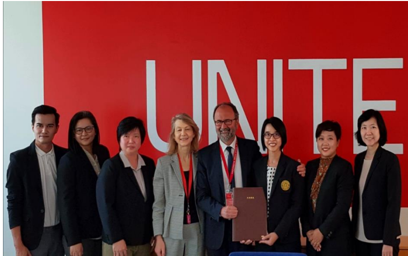
Figure 5 MoU signing ceremony at UNITE on July 9, 2018, KU and UNITE

The MoU detail is presented in the Annex 1.