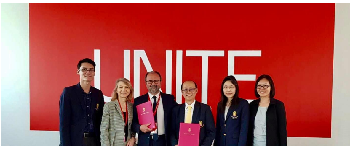
Figure 4 MoU signing ceremony at UNITE on July 9, 2018, CU and UNITE

The MoU between CU and UNITE as well as KU and UNITE are drafted and approved by Legal office of each university and Rector or the President signed the MOU on July 9, 2018 at University of Teramo.