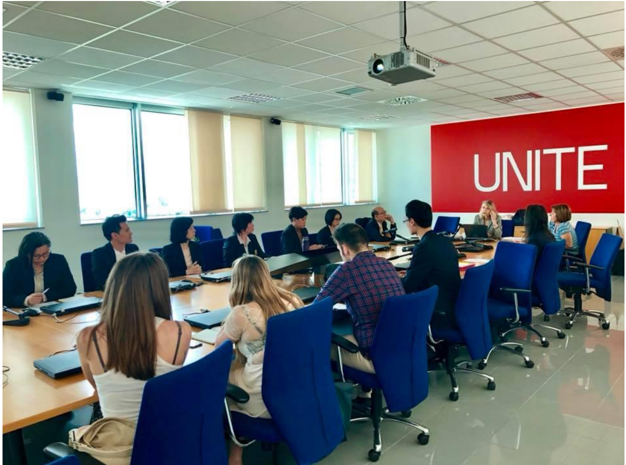
Figure 4 The discussion of study plan between CU, KU and UNITE at UNITE on July 9, 2018

The draft MoA and study plan of the Double Degree study programme between UNITE and CU is shown in the Annex 2 while MoU between KU and UNITE are reported in Annex 3.